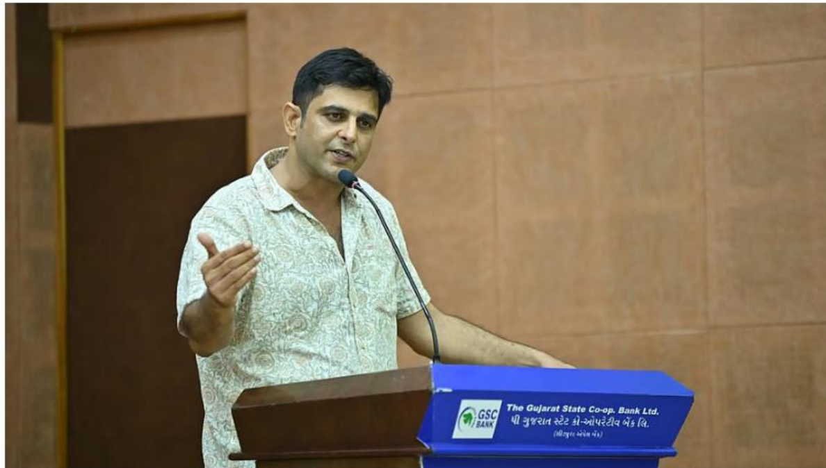
NRAI President Kalikesh Narayan Singh Deo.